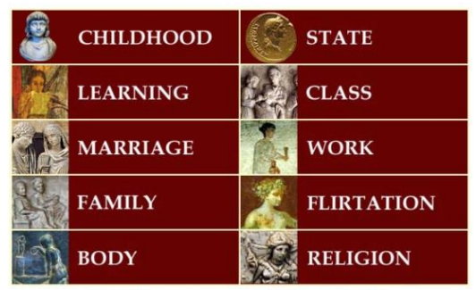
Explore the Worlds of Roman Women in Texts and Images

TEXTMAP (list of Companion texts), AUTHORS, WOMEN